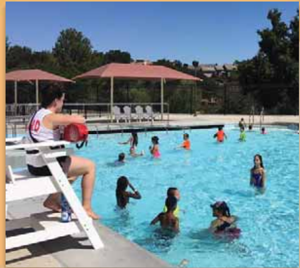
Public Swim 1-4 pm Monday—Saturday/ $5 Day