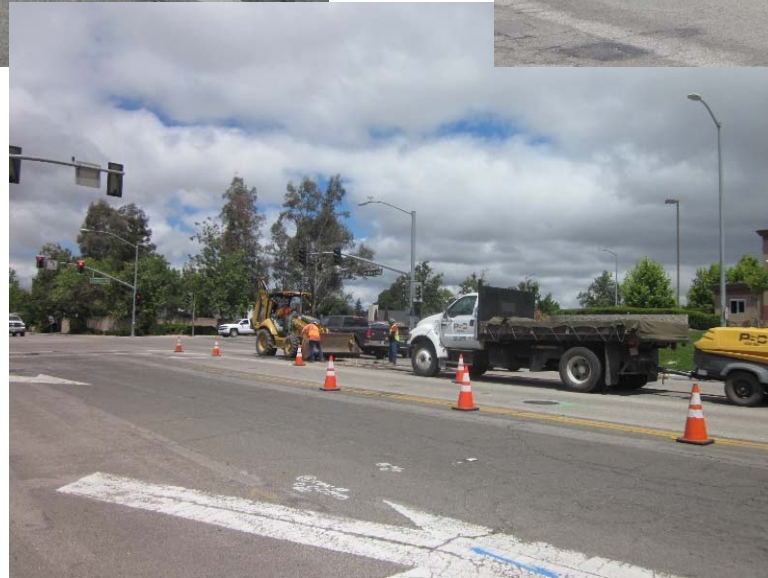
The Gas Company on-site making repairs to their pipelines (05/25/2018)