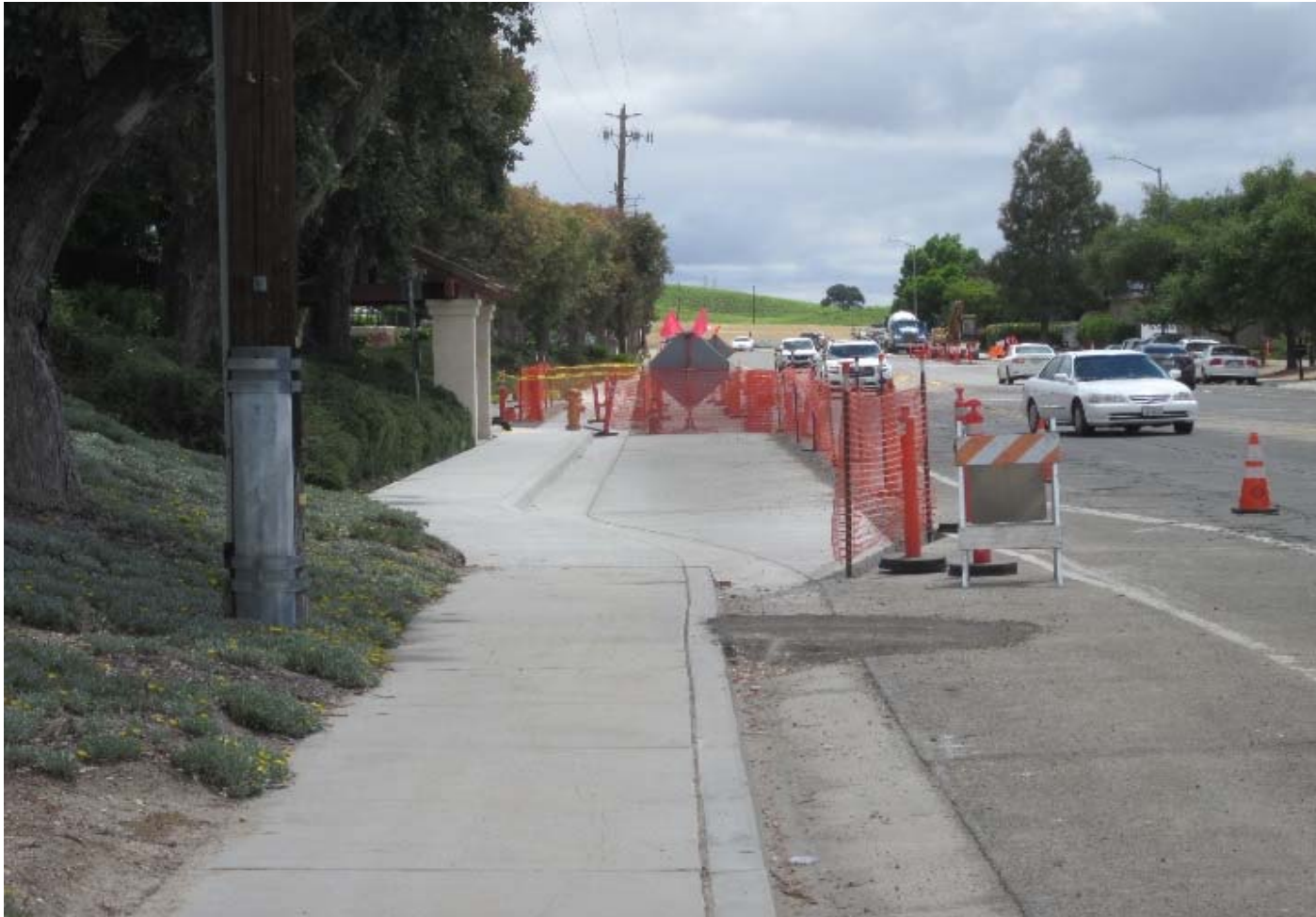
The first phase of the work is to upgrade deteriorated concrete sidewalks and gutters (05/25/2018)